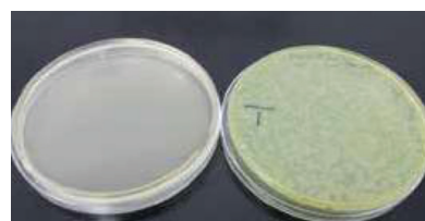
Challenge with 108cfu/ml P.a. (ATCC No. 15442) Swabbing (16 hrs. after contamination)